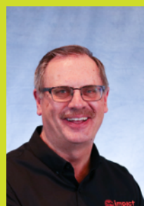
Dale Middle East